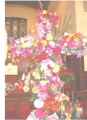
Easter Morning 2009

We also need a more volunteers to serve on our Sunday Secretary team. Please call the church office if you would like to serve or for more information.