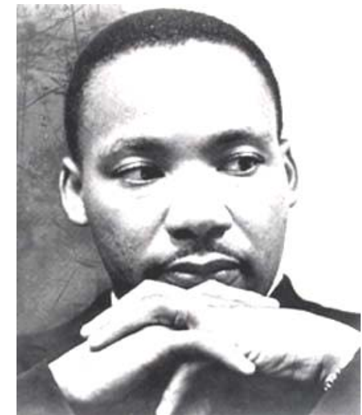
"I have a dream." - Martin Luther King, Jr.

The first Saturday of each month is a paper drive with all proceeds going to support the "Chapel on Wheels" program. Paper of any kind is accepted from 9:00AM to Noon at the Southeast corner of Chapman and Raymond, Southeast corners of Chapman at Euclid and on Laguna Road between Valencia Mesa and Bastanchury.